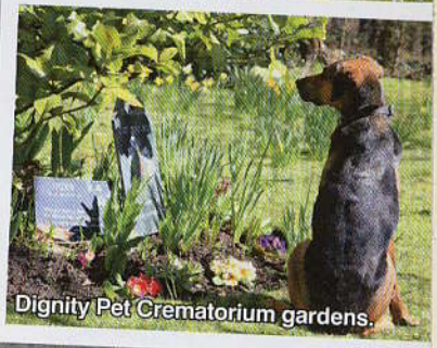
Dignity Pet Crematorium gardens.